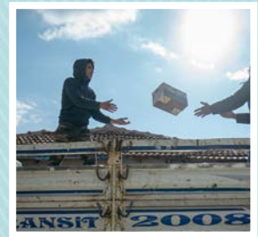
Refugee and Emergency Support