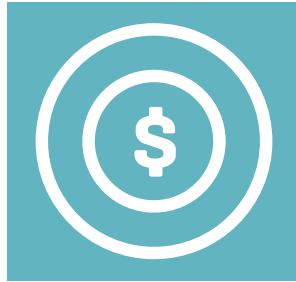
US Grant Programming