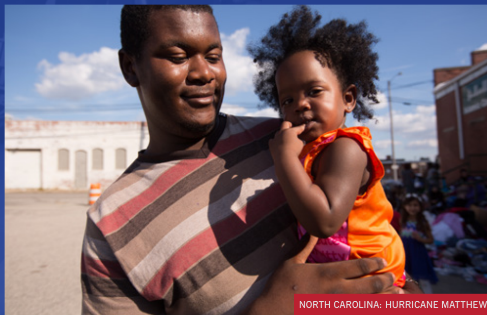
NORTH CAROLINA: HURRICANE MATTHEW