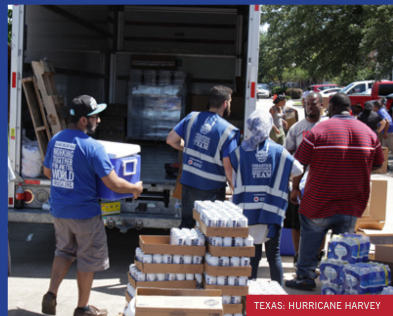
TEXAS: HURRICANE HARVEY