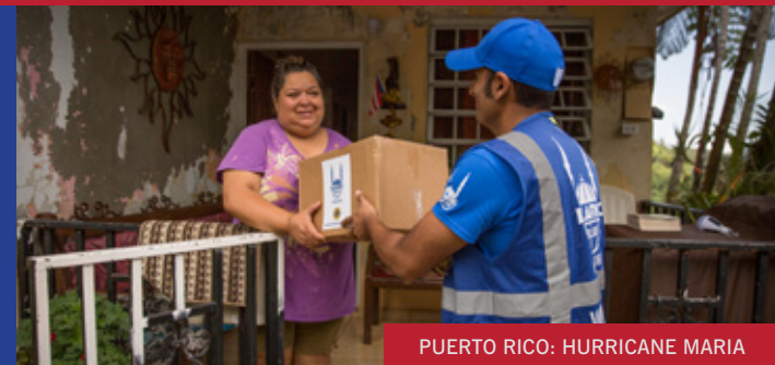
PUERTO RICO: HURRICANE MARIA