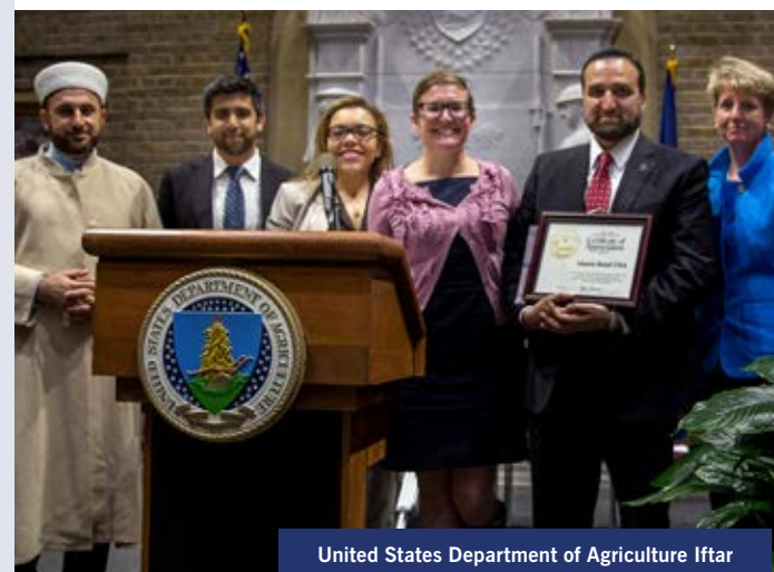
United States Department of Agriculture Iftar

The conference resulted in the adoption of a New Urban Agenda, which sets global standards for urban development. The agenda acknowledges the need for special attention to be devoted to refugees and other vulnerable groups.