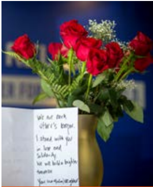
Roses delivered from a neighbor to IRUSA office in Virginia

At Islamic Relief USA, we believe in building bridges to connect people. It is important for us at this time in America to be patient when people are trying to divide us. This is a time when we need to work with other like-minded people who believe in social justice for all, here in America and across the world.