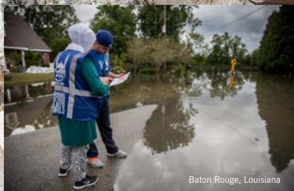
Baton Rouge, Louisiana