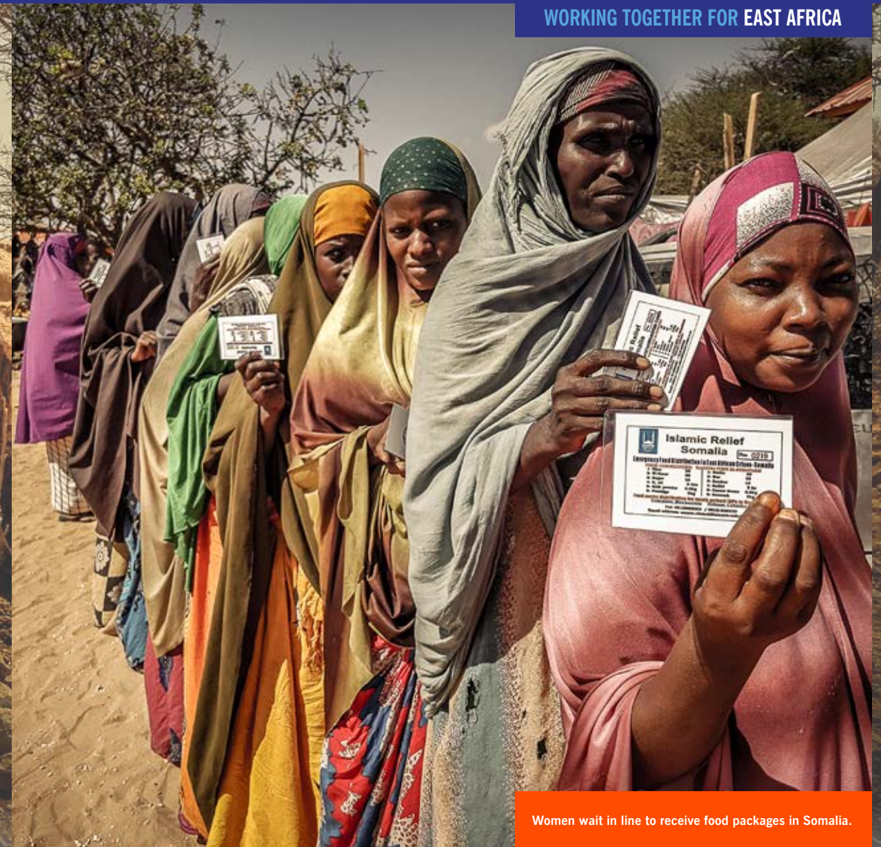
Women wait in line to receive food packages in Somalia.

For most of East Africa, the nightmare of drought is a recurring one. In the past year alone, the situation has been declared an emergency by Islamic Relief twice. 20 million people are in urgent need of humanitarian aid.