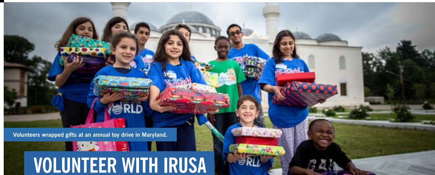
Volunteers wrapped gifts at an annual toy drive in Maryland.