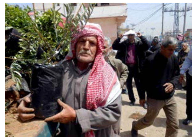
A farmer picks up an olive tree sapling to be planted on his farm in Deir Al Balah.