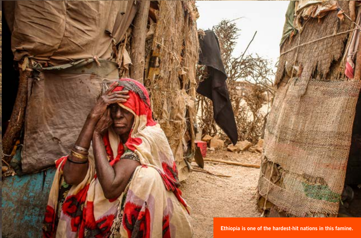
Ethiopia is one of the hardest-hit nations in this famine.