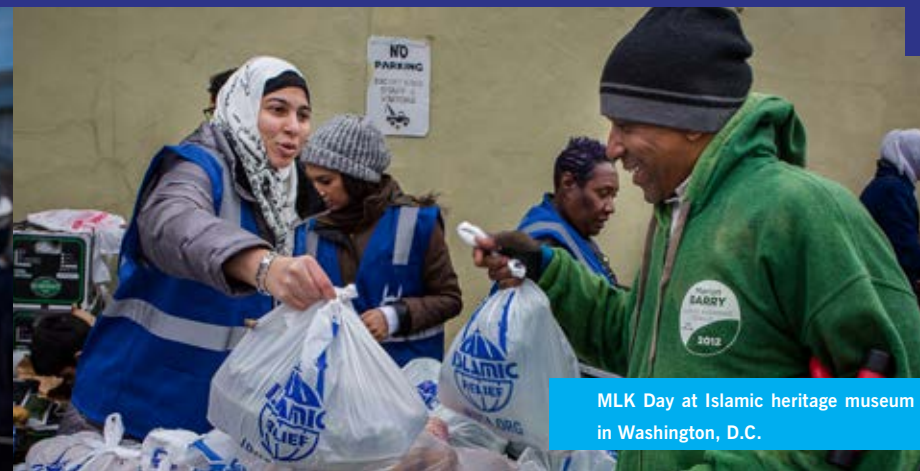
MLK Day at Islamic heritage museum in Washington, D.C.

IRUSA also continues to support two other community health clinics in the United States.