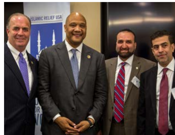
Rep. Kildee and Rep. Carson at Capital Hill Ramadan welcome

IRUSA will also host an iftar inviting allies from NGOs and government to come together to break bread and reflect on our commitment to displaced peoples around the world.