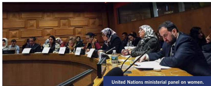
United Nations ministerial panel on women.