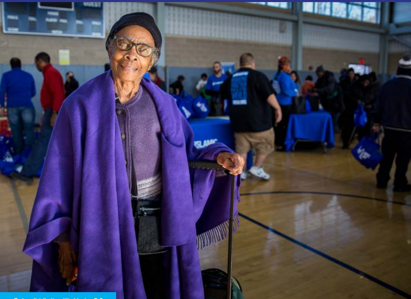
Turkey distribution, Washington D.C.