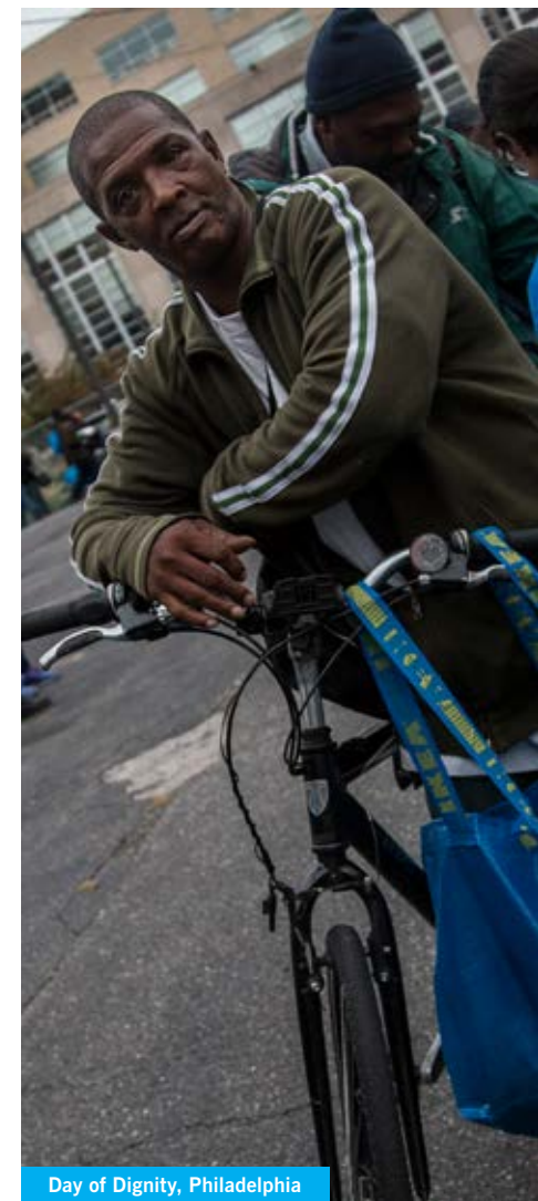
Day of Dignity, Philadelphia