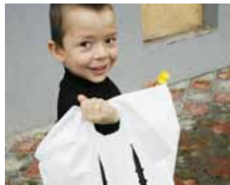
Udhiyah/Qurbani meat distribution