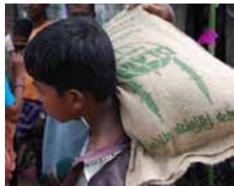
Ramadan food distribution

In 2012, Islamic Relief USA funded 65 international programs. Of these, 28 were new, and 37 continued from 2009, 2010 and 2011. IRUSA also successfully continued annual programs including: