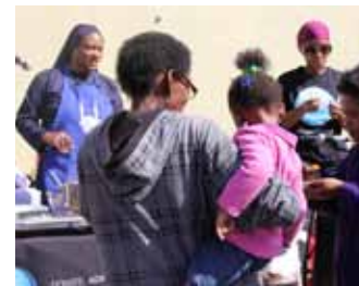
Day of Dignity (USA)

Thanks to our donors, in 2012, we've touched the lives of 2,372,847 people globally.