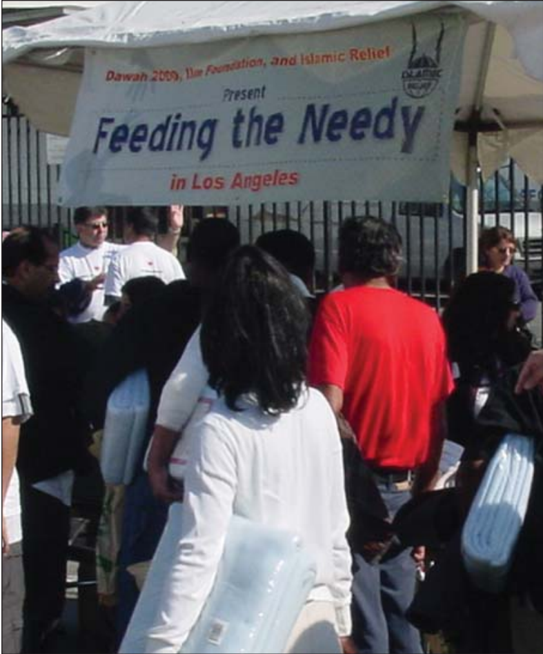
Over 3,000 homeless people benefited from the event

Islamic Relief USA, which is a partner with the Ilm Foundation for its monthly homeless feedings as well as other activities, is committed to help expand the work of the coalition. •