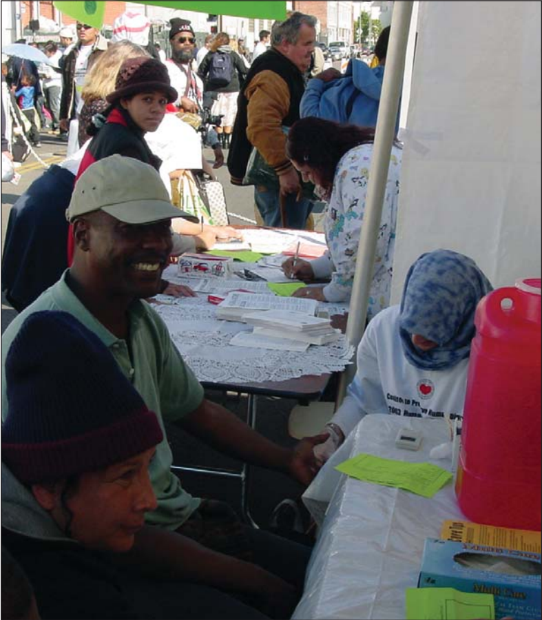
Health screenings were among the services provided to the homeless