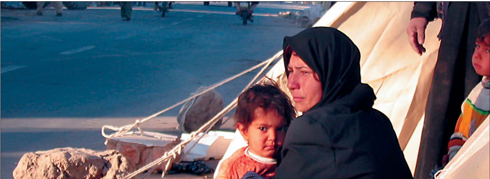
Earthquake victims in Iran in an Islamic Relief Worldwide-administered refugee camp