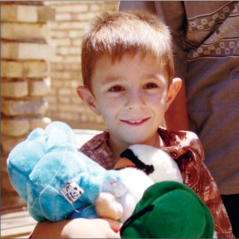
Islamic Relief beneficiaries in Iraq