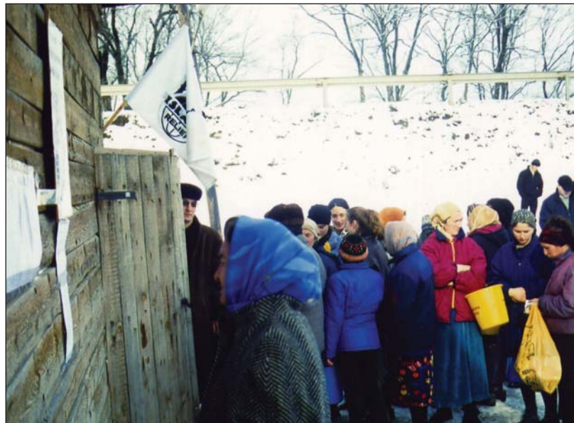
Chechens standing in line in the bitter cold to receive aid

Islamic Relief Worldwide has been helping the Chechens since 1995, providing food assistance, shelter, primary medical care, clean water and sanitation. •