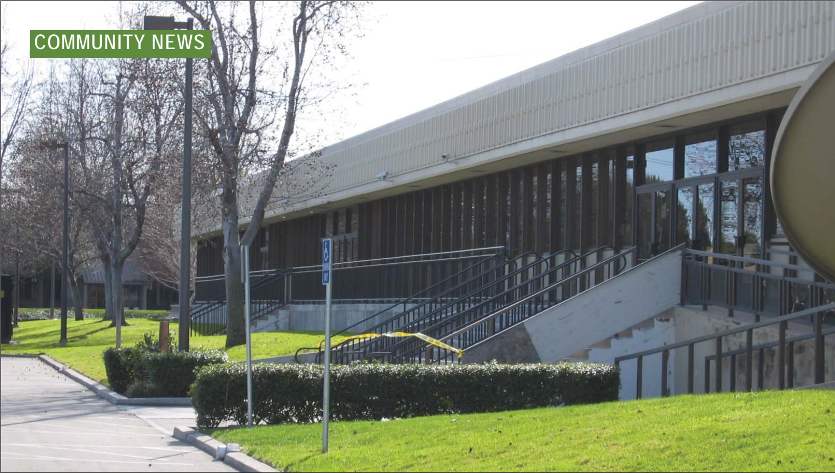
Muslim Community Association (MCA), Santa Clara, CA