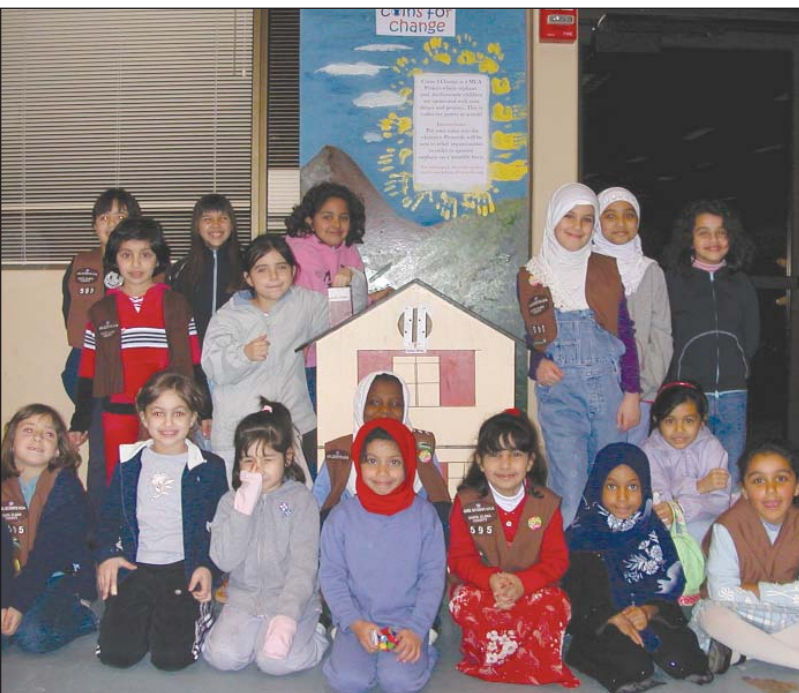
Girl Scouts display the "Coins 4 Change" station

Jazakum Allahu khayran! May Allah reward all of you for your hard-work. •