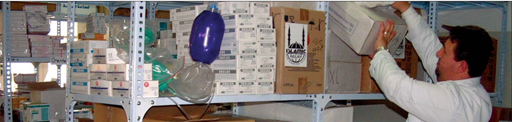
Medical equipment donated by Islamic Relief Worldwide to hospitals in Palestine

Islamic Relief USA has been growing steadily over the last few years. We thank Allah first, as well as all our donors, supporters, and volunteers across the country for helping us achieve the goals that we all share - alleviating the poverty and suffering of the world's poorest people, as well as providing lasting, sustainable solutions to help people help themselves. •