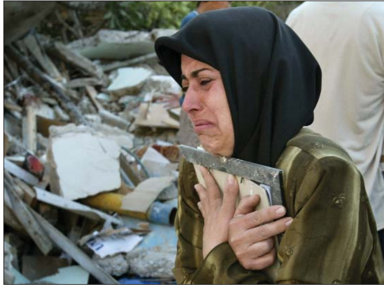
A Palestinian woman standing in front of her demolished home, cries, while holding her family picture

Islamic Relief Worldwide is distributing aid to a total of 400 affected families, including 400 food packages, 800 mattresses, 800 blankets, 1,600 pillows, 400 sets of kitchen tools, 400 hygiene kits, and clean drinking water. In addition, IRW has purchased healthcare items to support the only existing hospital in Rafah, the Abu Yousef al-Najjar hospital, which serves over 100,000 people. Islamic Relief Worldwide will provide emergency medical supplies and medical equipment, including x-ray machines and ECG monitors. •