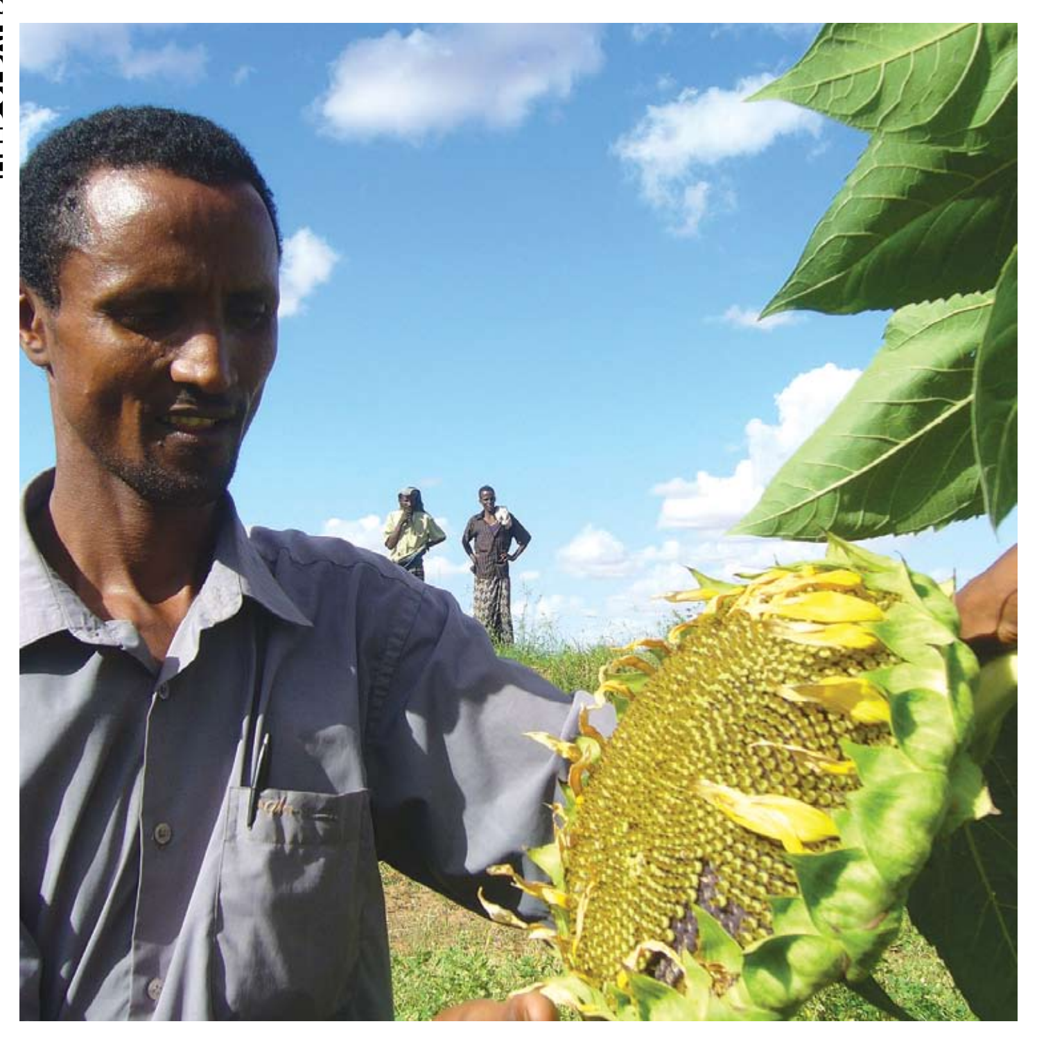
Rising food and fuel prices, violent protests and riots are all calling for an immediate response to worsening world food insecurity.

Global food crisis threatens community security