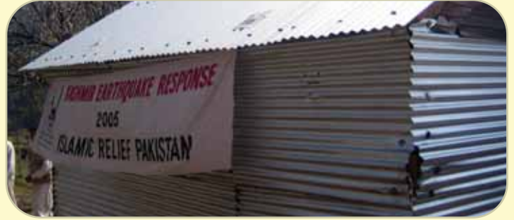
One of Islamic Relief's shelter projects for earthquake victims in Pakistan.

- Prince Charles of Wales, October 11, 2005