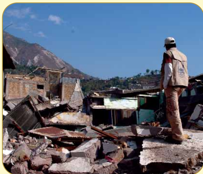
Top: Islamic Relief staff members distributing aid to victims