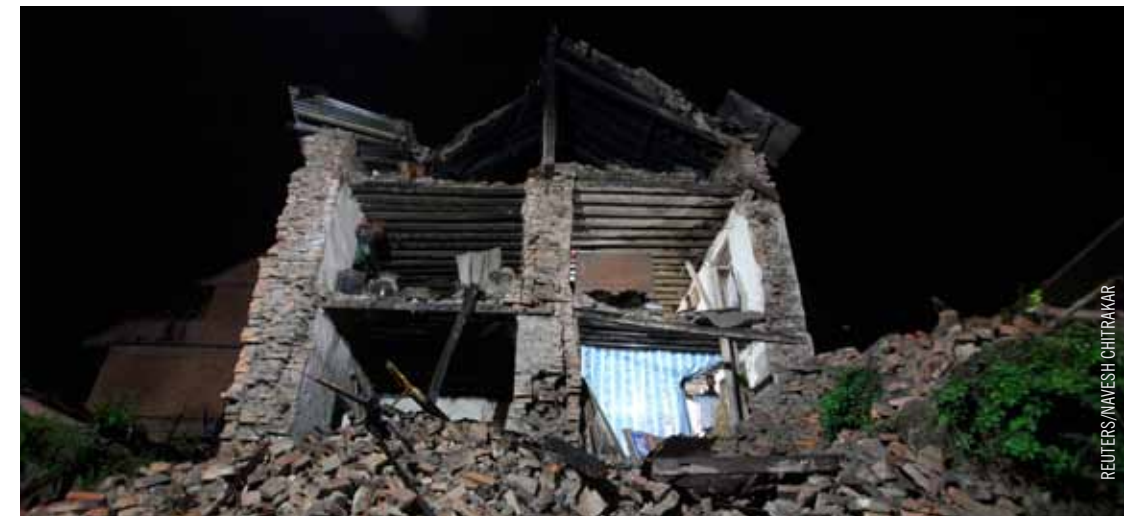
Homes like this one were destroyed when a 7.1-magnitude earthquake struck Van Province in Turkey last fall.