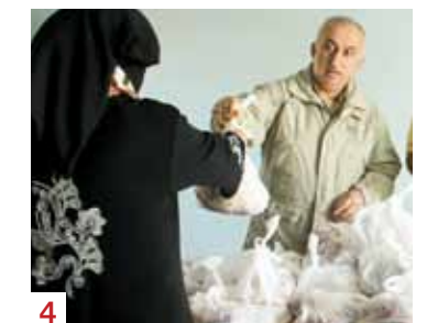
1. Somalia 2. Pakistan 3. Bangladesh 4. Sri Lanka