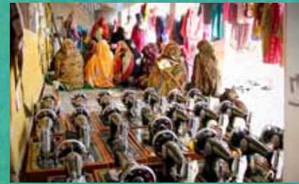
LEFT: Women study tailoring before receiving new sewing machines to improve their livelihood.