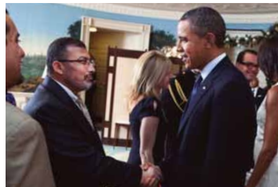
President Barak Obama Recognizes Islamic Relief USA’s Work