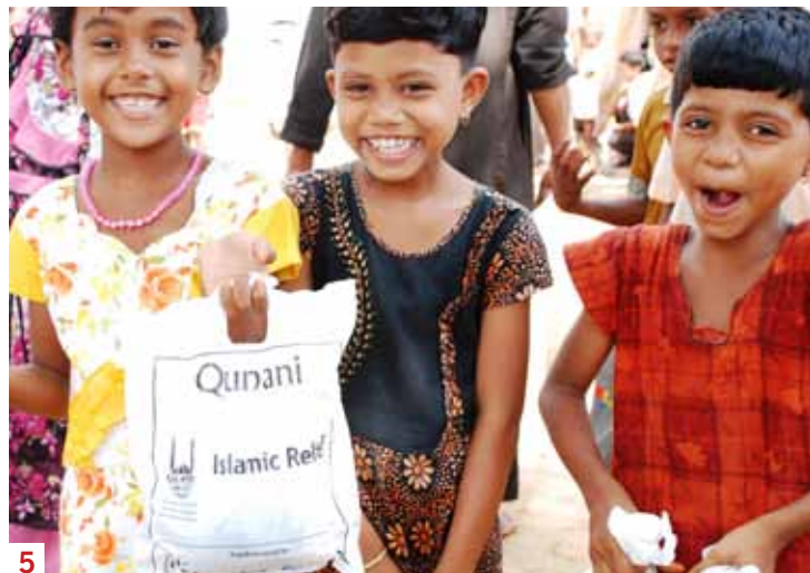
1. Mali 2. Chechnya 3. Iraq 4. India 5. Sri Lanka