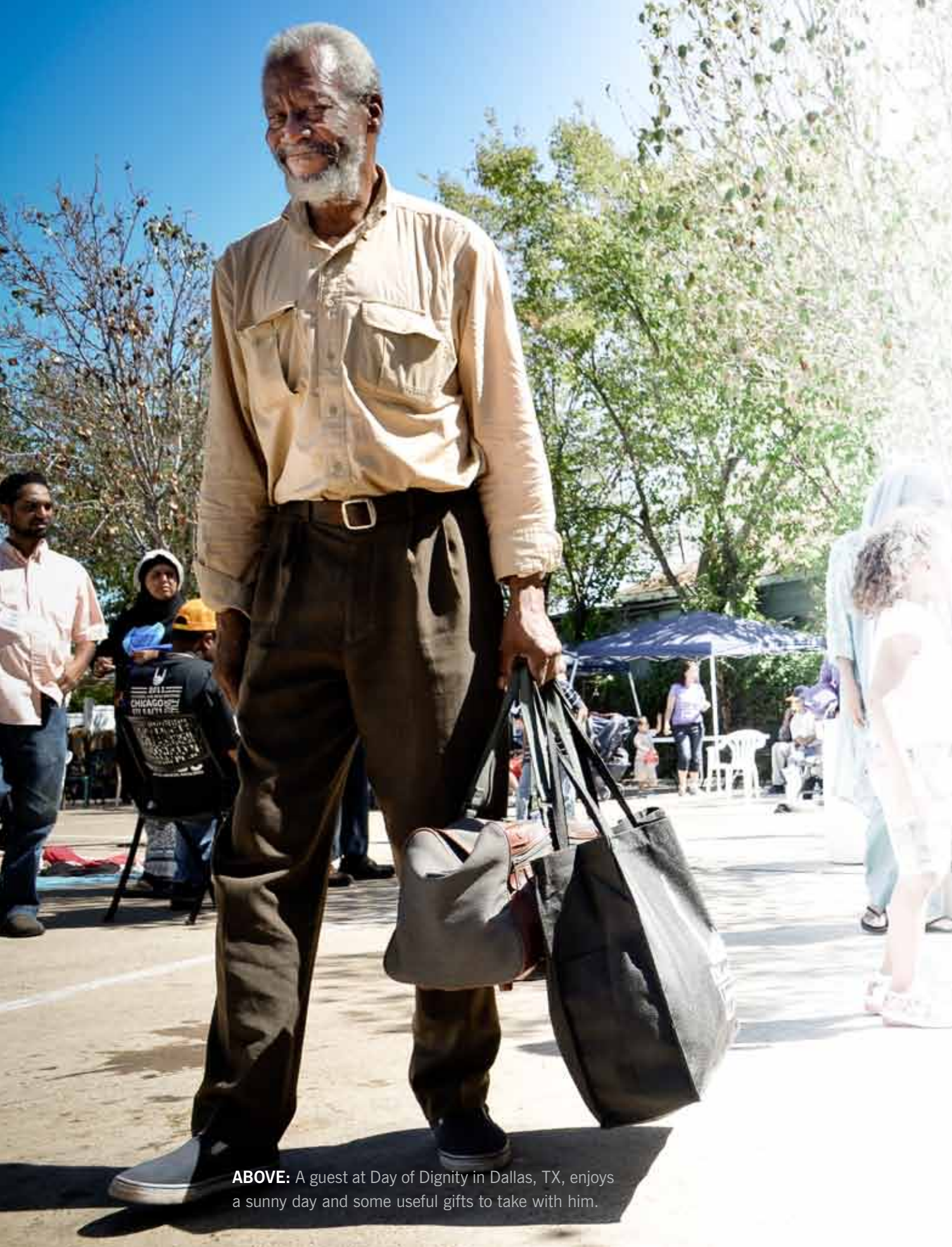
ABOVE: A guest at Day of Dignity in Dallas, TX, enjoys a sunny day and some useful gifts to take with him.