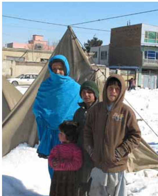
When below-freezing temperatures hit, displaced families were unprepared for the cold.

Islamic Relief USA's donors responded quickly to appeals for help, sending money to buy fuel and food so 1,000 impoverished families could have both. Families received 200 pounds of coal, more than 100 pounds of flour and 22 pounds of rice, along with sugar and cooking oil. These simple provisions meant lifesaving warmth and full stomachs—and the strength to get through the rest of the winter.