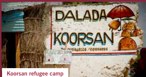
Koorsan refugee camp