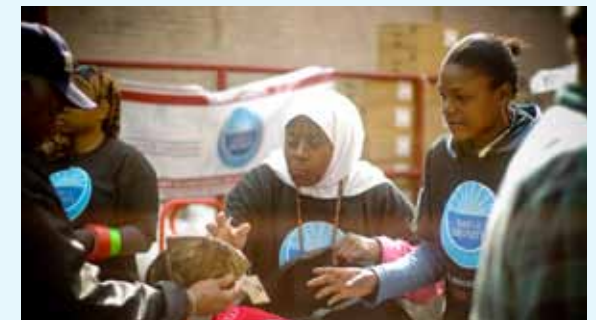
Volunteers staff the booths at Day of Dignity 2011 in New York City.

Find out how you can help in your area! VISIT IRUSA.ORG/VOLUNTEER .