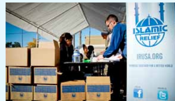
A volunteer registers participants at Day of Dignity 2011 in Minneapolis.